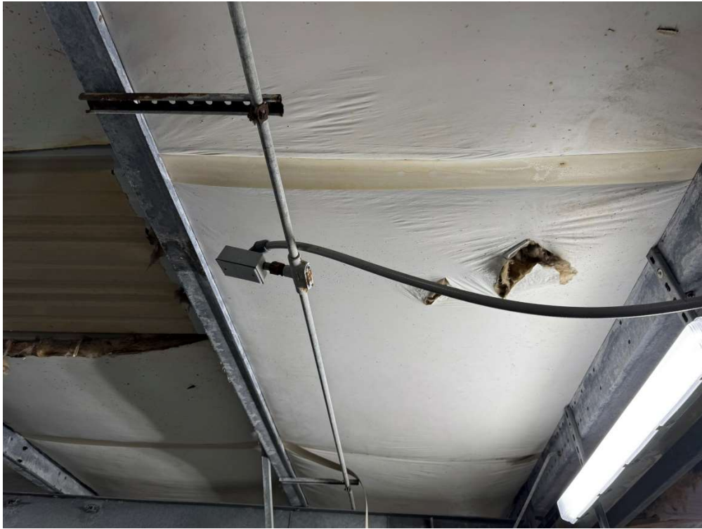
Train #1 and Train #2 Interior Photos: